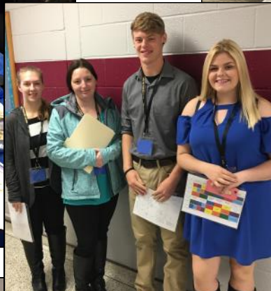
A few of our great Tour Guides for the Day!