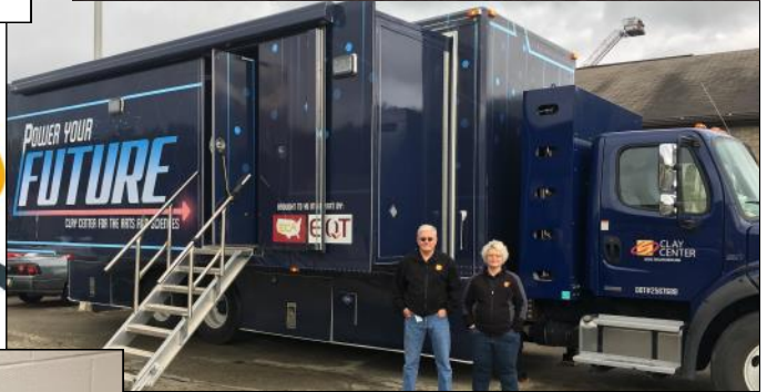
"POWER YOUR FUTURE" mobile exhibit—The Clay Center