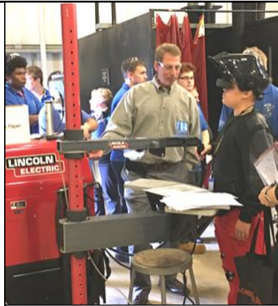
A student participates in an Interactive Welding Exhibit